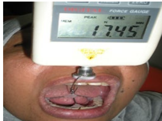
Figure:6,7 Measurements of RPD retention