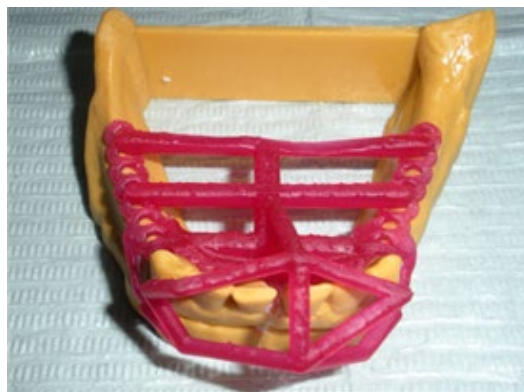
Figure:4 The 3D printed framework pattern on the 3D printed polyamide model