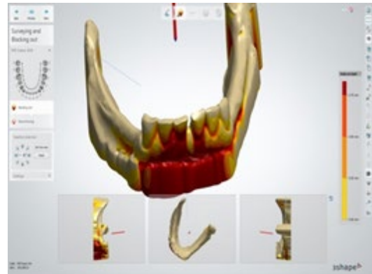
Figure:2 Digital surveying and block out