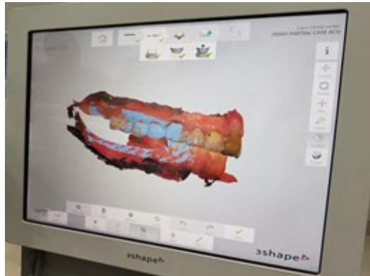
Figure:1 Digital impression