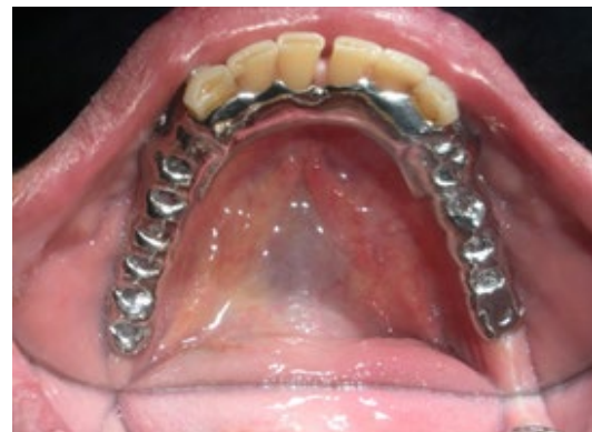
Figure:5 Try in of the metal framework