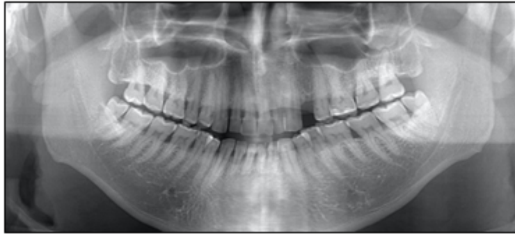
Fig 3: Panoramic radiograph showing Bilateral Distomolars in lower arch: