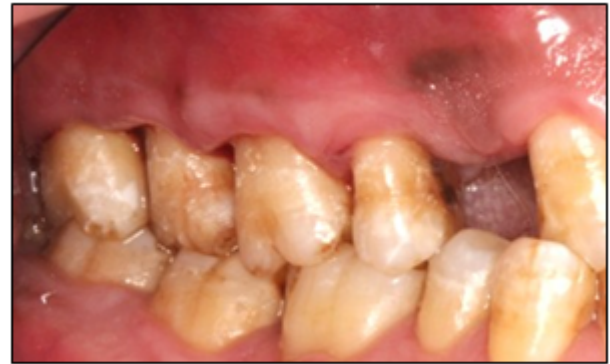
Fig 5: 12 months postoperative view showing absence of enlargement in maxillary left and right buccal region: