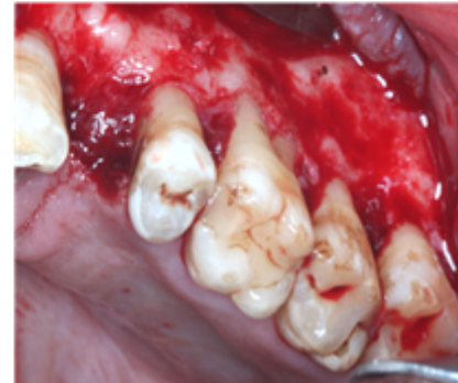
Fig 4: Resective osseous surgery of maxillary right and left buccal exostosis: